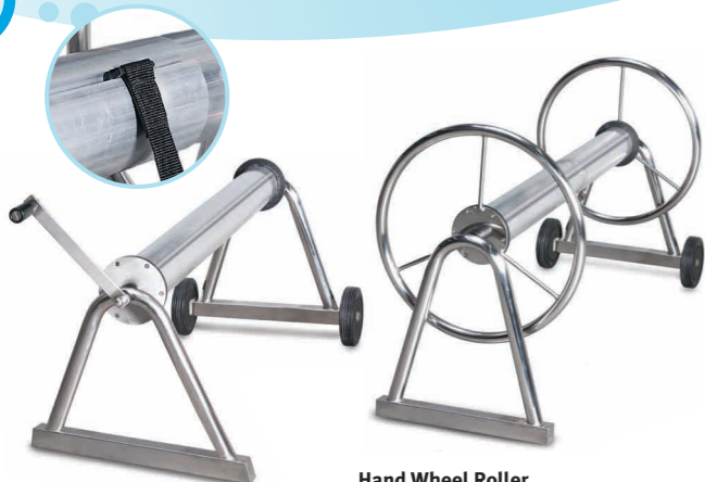
Crank Roller 2 and 3 - Mobile

Our rollers can be customised to suit any size of pool cover, from small domestic pools to commercial Olympic pools, or any specialist order for motorisation or site-specific modifications. There is one to suit every budget and need!